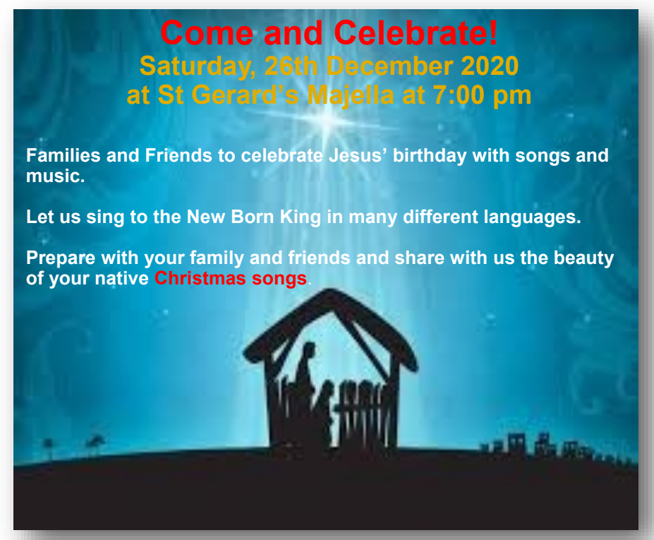
Please note that COVID-19 restrictions will apply. More information to come.